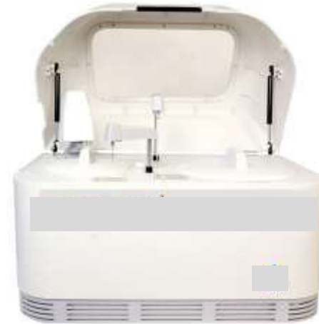
Biochemistry Analyzer Random Analyzer