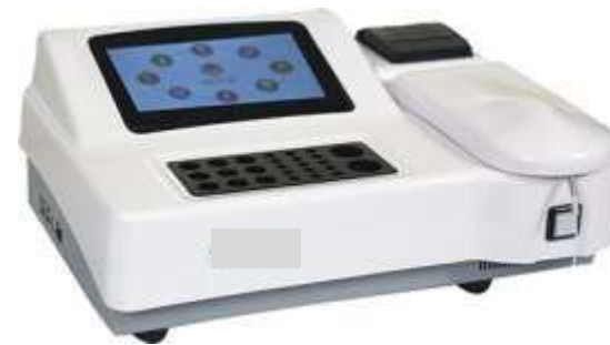
Biochemistry Analyzer Semi Auto