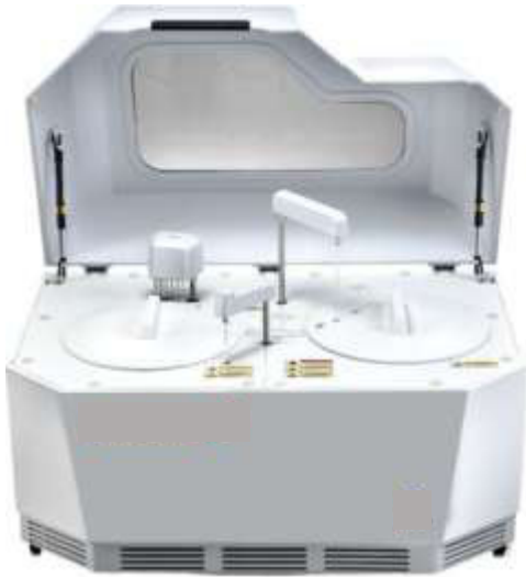
Biochemistry Analyzer Random Analyzer