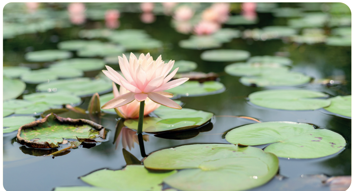
Waterlily Plant (Nymphaeaceae)

* The % Daily Value (DV) tells you how much a nutrient in a serving of food contributes to a daily diet. 2,000 calories a day is used for general nutrition advice.